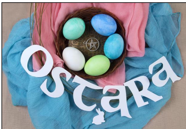
Neo-pagan Ishtar or Ostara eggs

God would never approve of using eggs to represent the resurrection of our Lord. As the Apostle Paul noted, it is the heathen cultures that have “exchanged the truth of God for the lie, and worshiped and served the creation rather than the Creator” (Rom. 1:25). As innocent as Easter eggs may seem to most people, they simply have no place as a religious symbol in true Christianity. Modern pagans understand this and continue to use eggs in their Ishtar celebrations.