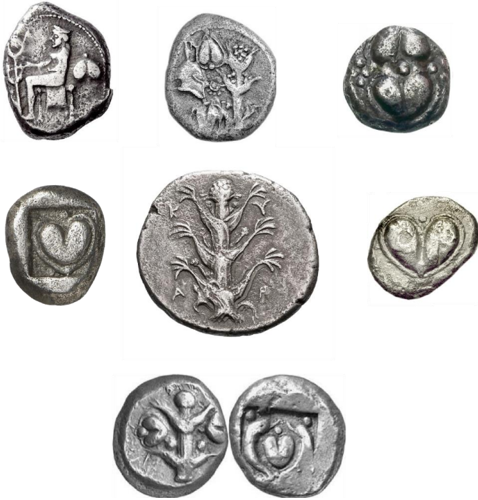
Crude Cyrenaican coins depicting silphium and its fruit ca 510-490 B.C.

Soranus, antiquity's foremost gynecologist, wrote, "To some people it seems advisable once during the month to drink Cyrenaic balm (silphium) to the amount of a chickpea in two cyaths of water for the purpose of inducing menstruation... these things not only prevent conception, but also destroy any already existing" ( Soranus of Ephesus , Gynecology, 63). Soranus believed silphium to have both preventative and abortive properties.