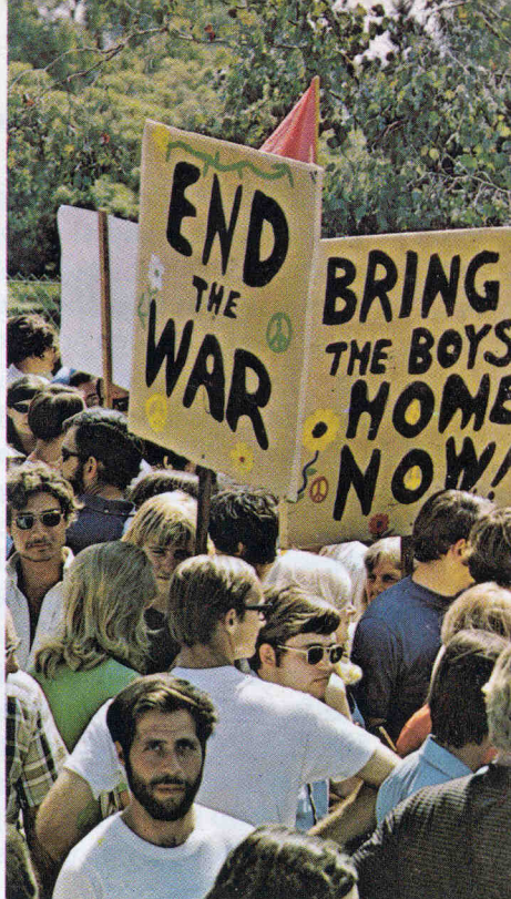
Ambassador College Photos

A NATION WITHOUT UNITED PURPOSE — As never before, Americans are unsure of their country, the future, their reason for being.